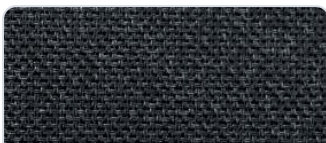
NOTT 5% openness