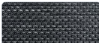
SAGA 5% openness