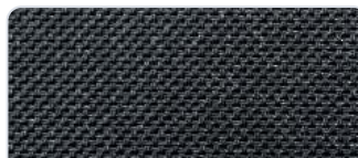
VORR 5% openness